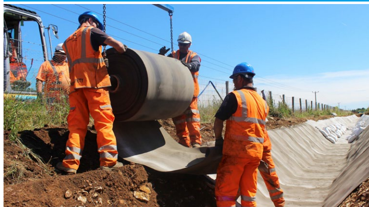
CC Bulk Roll