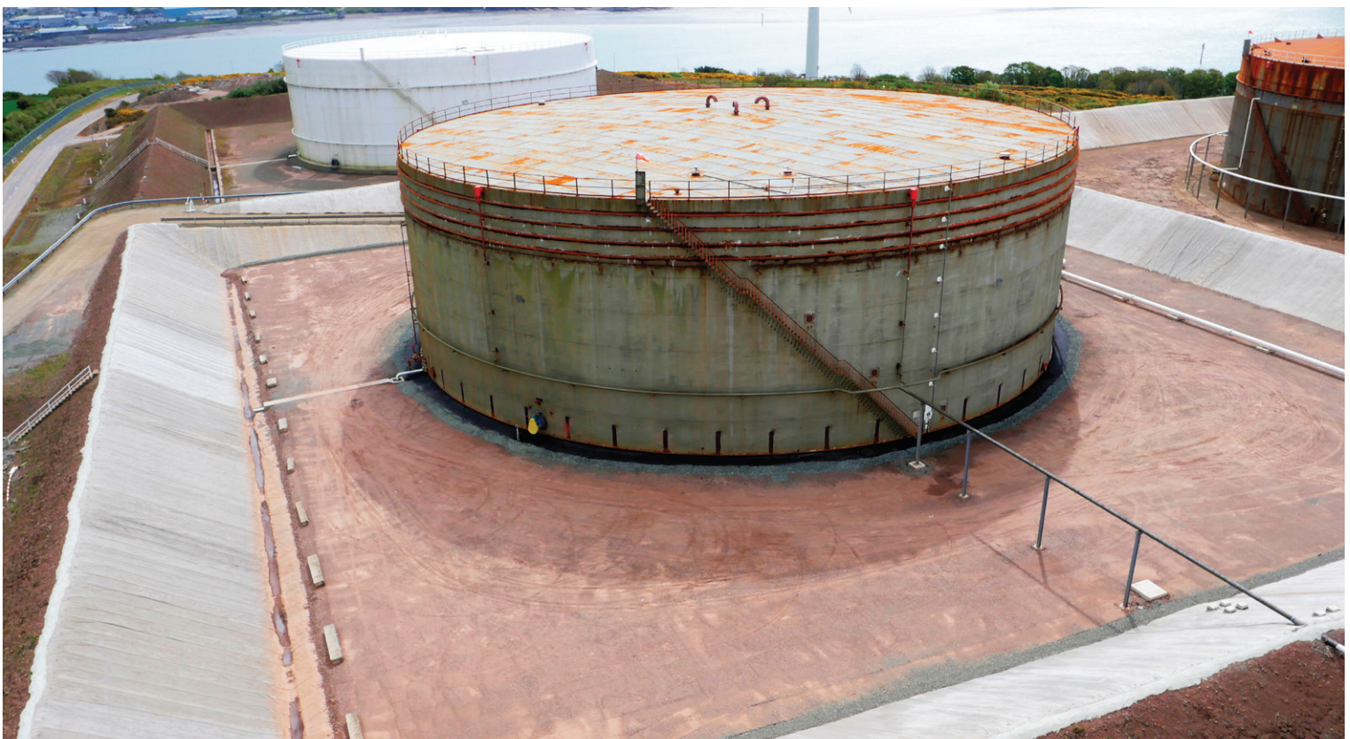
Image from drone footage of Tank 114 during installation and prior to painting of tank