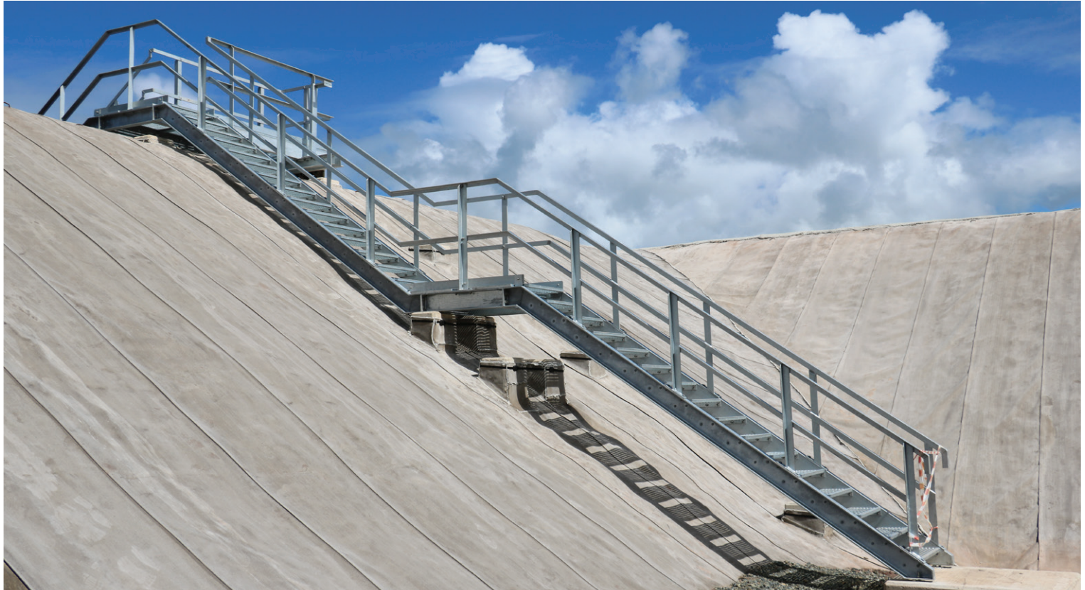
Step access detail