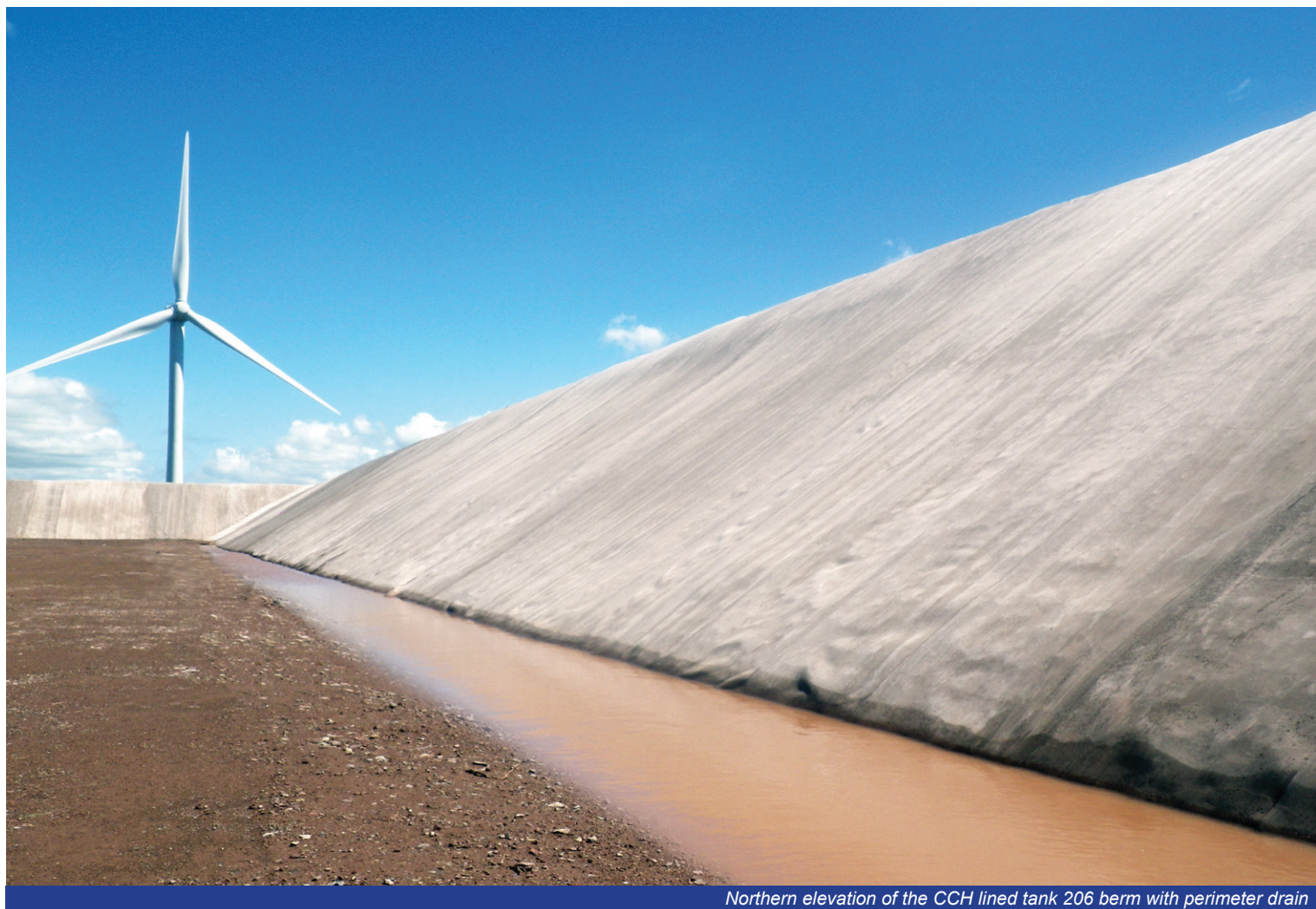
Northern elevation of the CCH lined tank 206 berm with perimeter drain

Following the success of the lining of tank 114, the system is being proposed for future containment schemes across the site and was awarded an ICE (Institute of Civil Engineers) Innovation Award in July 2017.