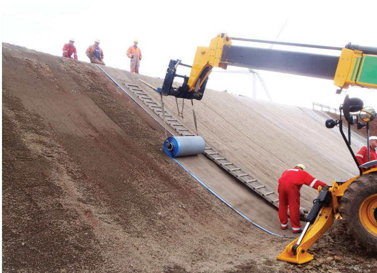
Deployment of the CCH