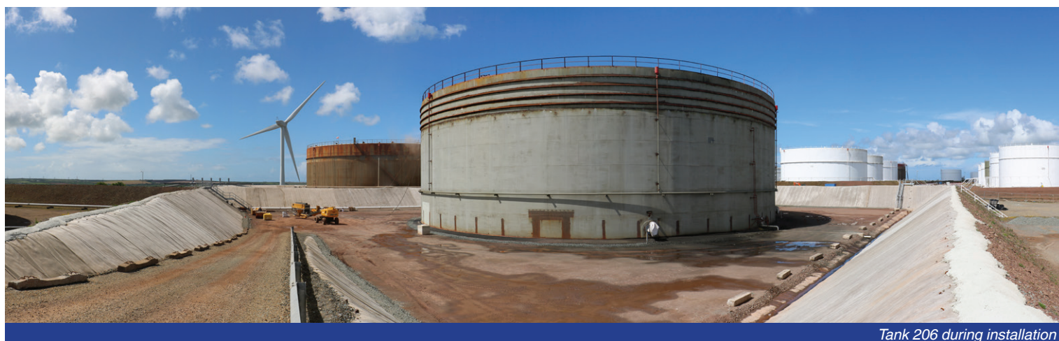
Tank 206 during installation

From a health and safety aspect, the use of CCH significantly reduced the amount of time that people were required to work on the embankments (height) in comparison with the use GCL and the associated systems. In other installations, CC Hydro™ also reduces the end of-life costs associated with treatment of any contaminated top cover.