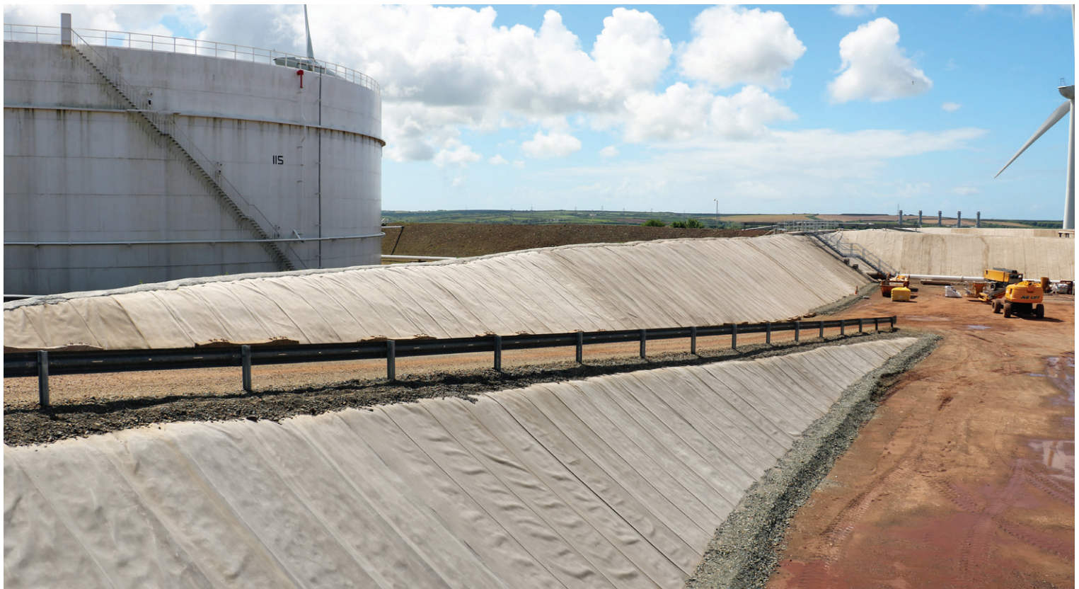
Access ramp detail