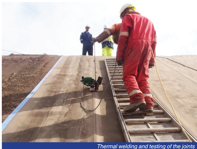
Thermal welding and testing of the joints