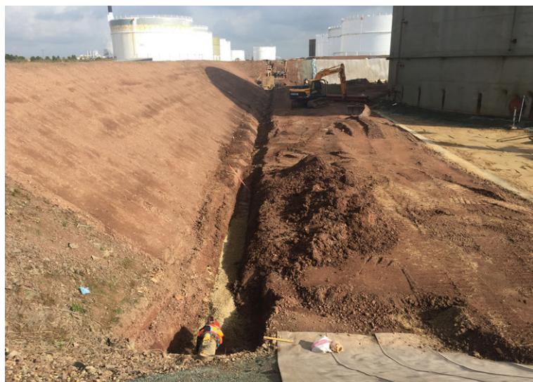
Preparation of the substrate

Following the welding and testing of the joints, CC Hydro™ was hydrated via the local on site water mains. CC Hydro™ cannot be over hydrated so there was no requirement to measure exactly the water:CC ratio.