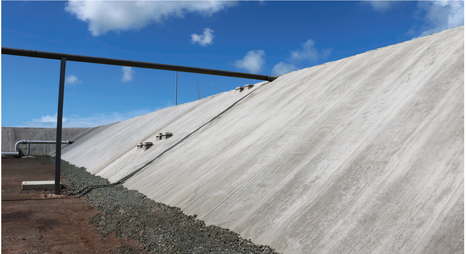
Pipe penetration detail in western elevation of Tank 114