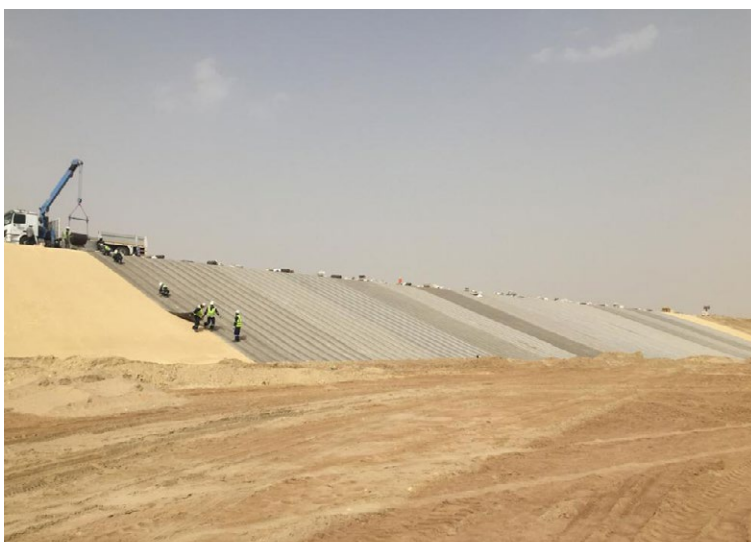
CC laid vertically