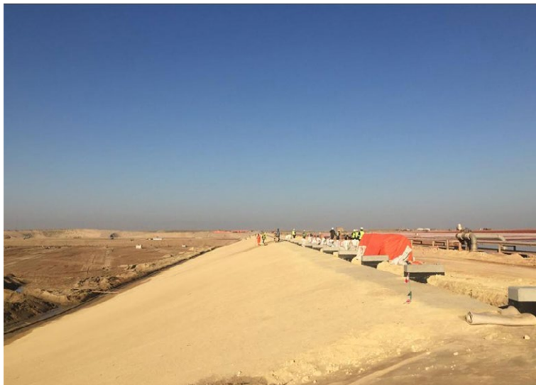
Site prior to works