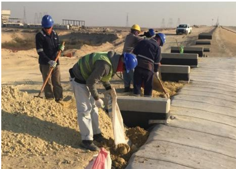
Anchor trenches backfilled to prevent ingress below material