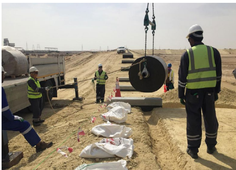
CC bulk rolls deployed from slope crest