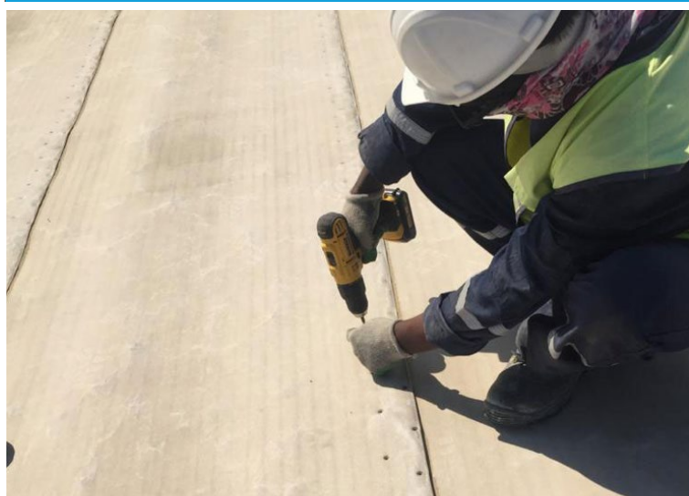
Screws inserted in a zig zag pattern to joint overlaps