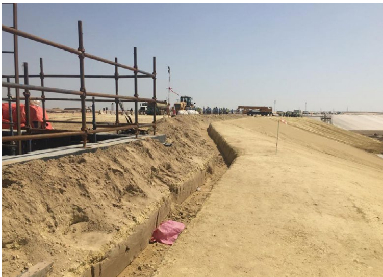
Anchor trenches were created prior to installation