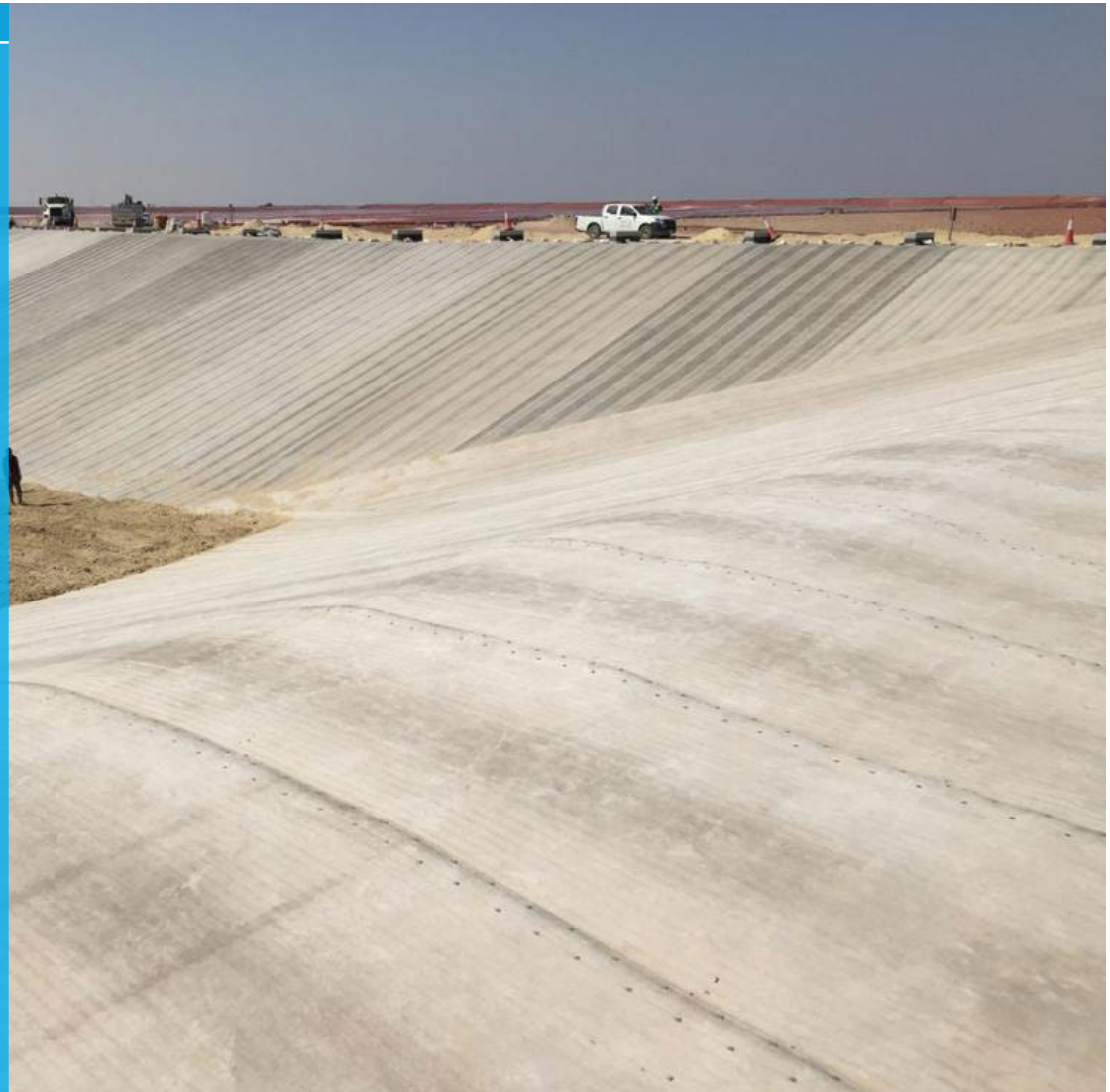
Completed CC bank erosion protection installation

In February 2020, Concrete Canvas® GCCM* was specified for a project in Ras Al Khair, Saudi Arabia, where an erosion prevention measure was required for embankment side walls.