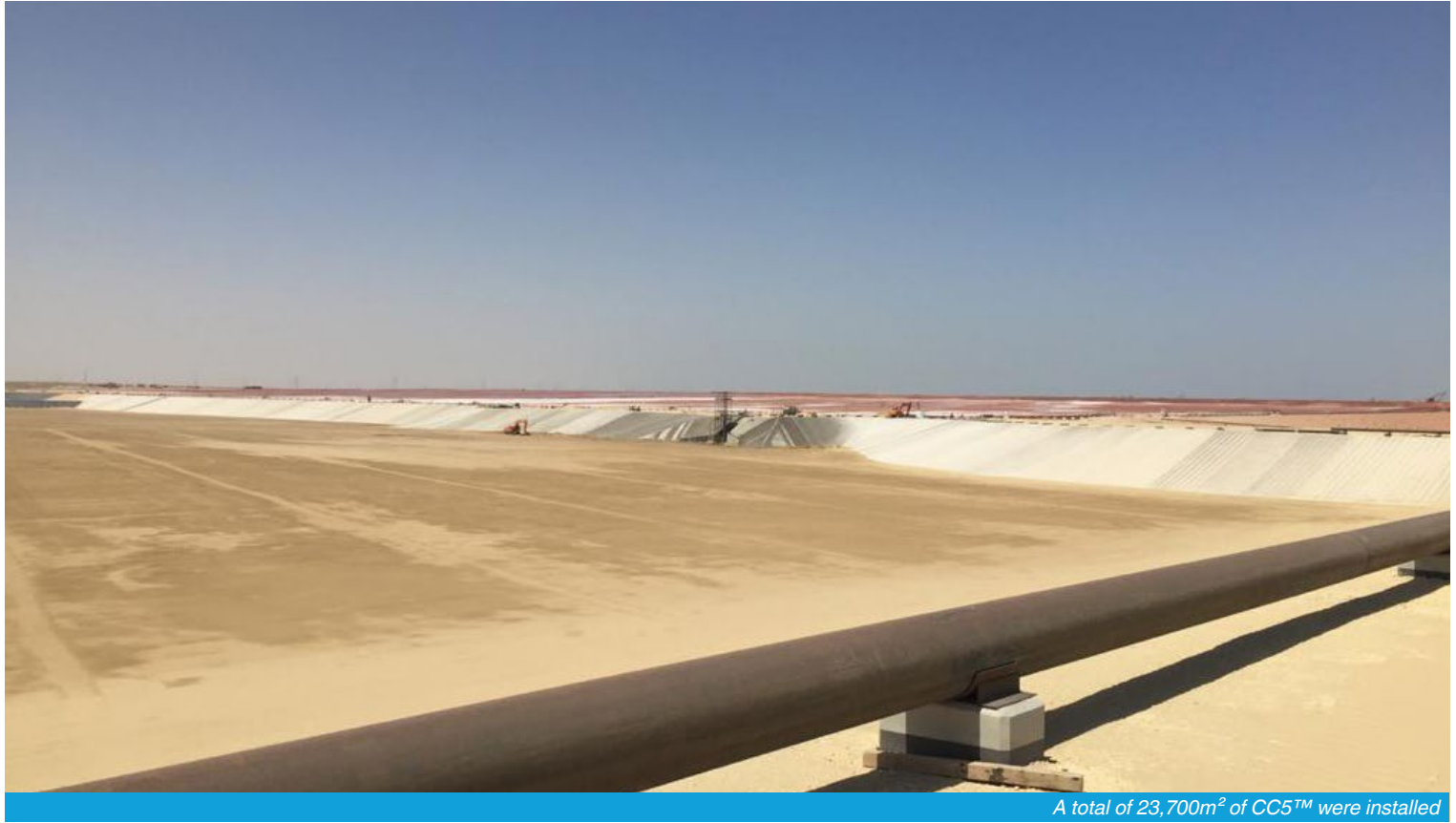
A total of 23,700m 2 of CC5™ were installed

Prior to the installation, the slope was graded and compacted to ensure a smooth surface on which to install the CC. Anchor trenches were then prepared at the crest and toe of the slopes, with the contractor taking care to ensure the excavation of the anchor trenches did not disturb or damage the lining below the top soil.