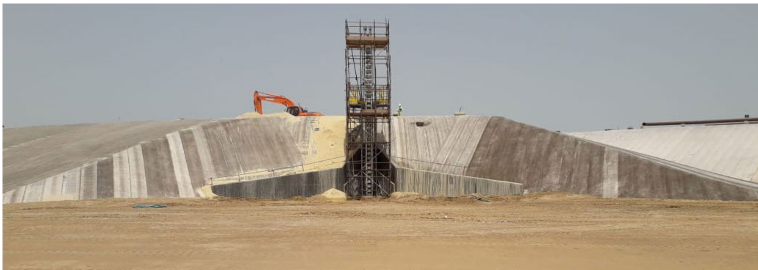
CC easily accomodates existing infrastructure