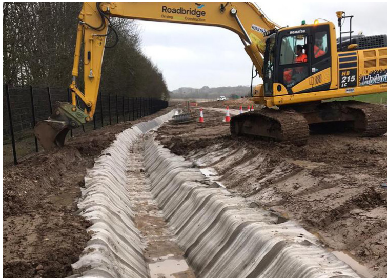
Excavator used to backfill anchor trenches