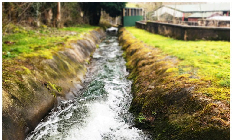
CC has been specified by the EA for use on environmentally sensitive sites