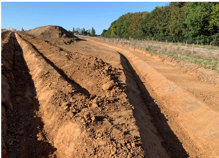
Intersection of the perimeter channels