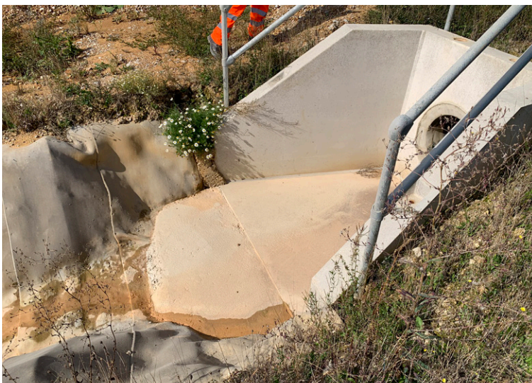
CC termination into headwall