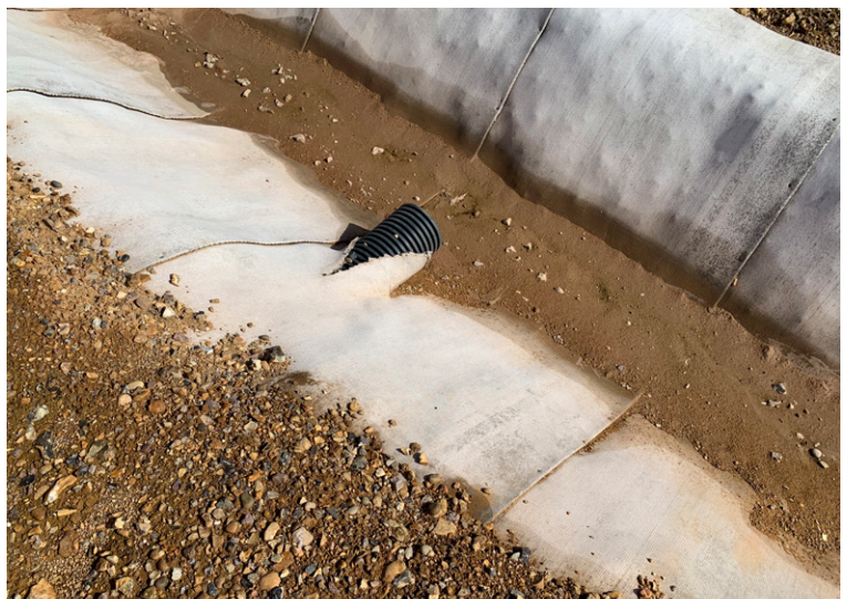
CC easily accomodates additional infrastructure like protruding pipes