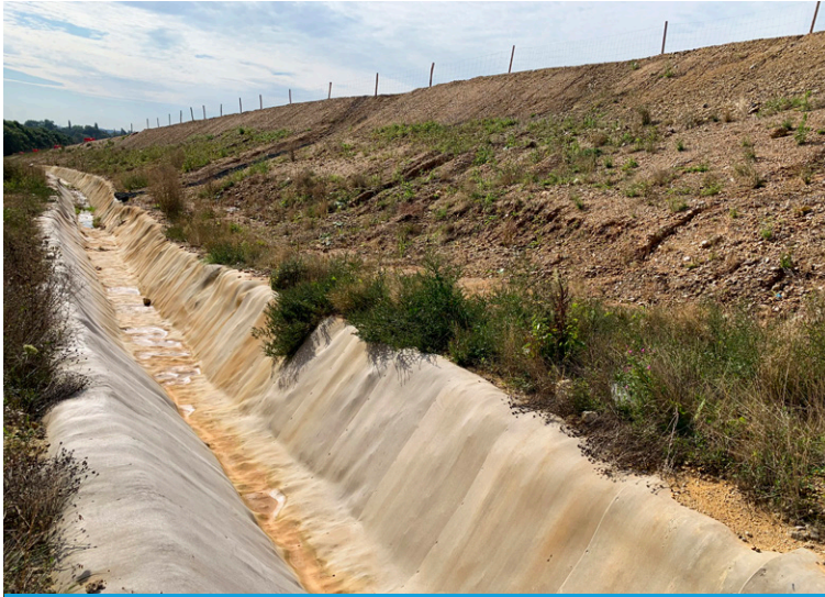
Completed perimeter channel 1 year after installation