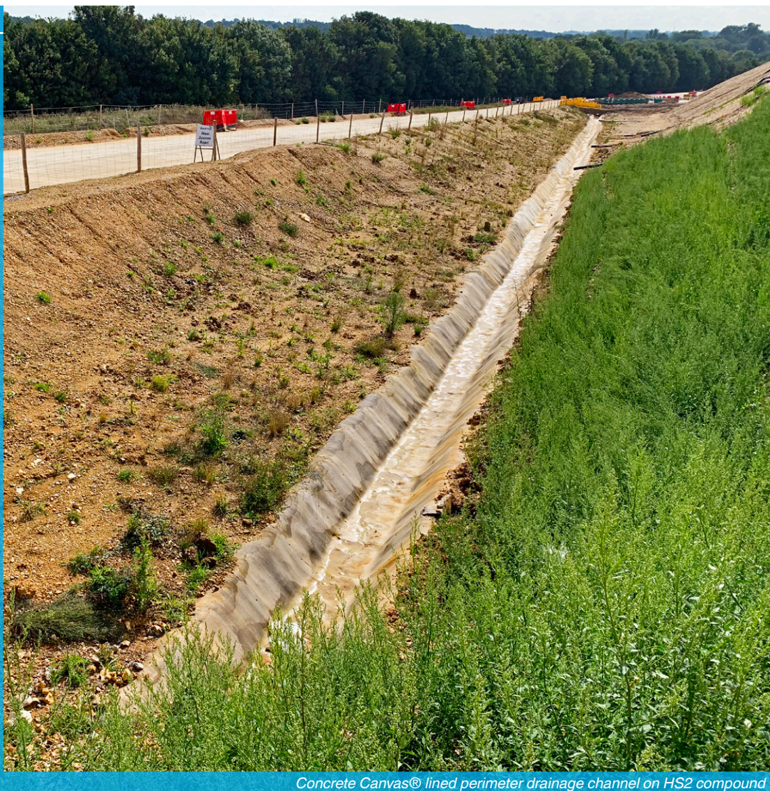
Concrete Canvas® lined perimeter drainage channel on HS2 compound