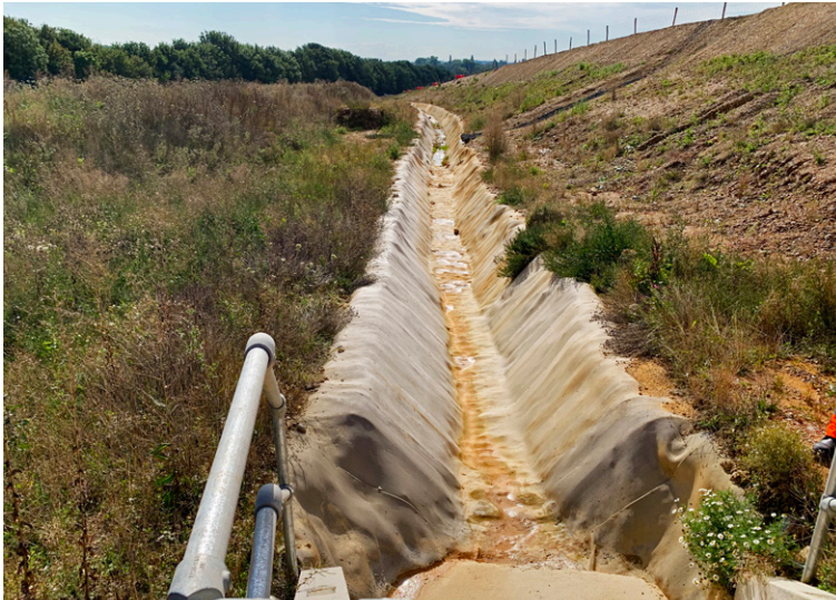
CC termination into concrete headwall