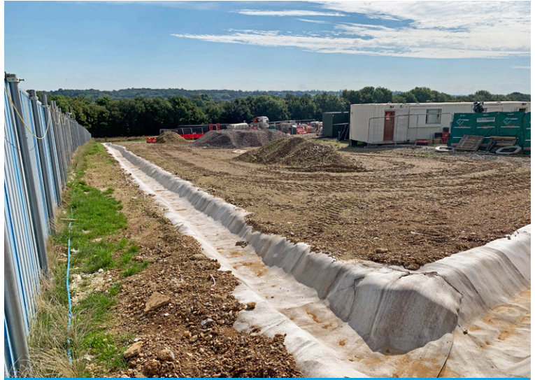
Corner detail of perimeter channel