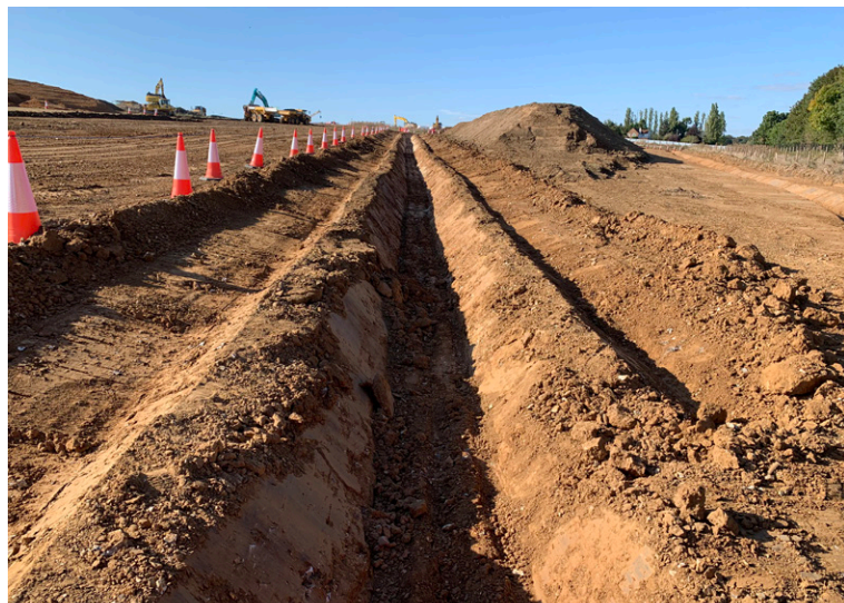
Channel was excavated using excavator with V bucket

Following installation, CC was hydrated using a bowser and hose and the anchor trenches then backfilled, providing a neater termination.