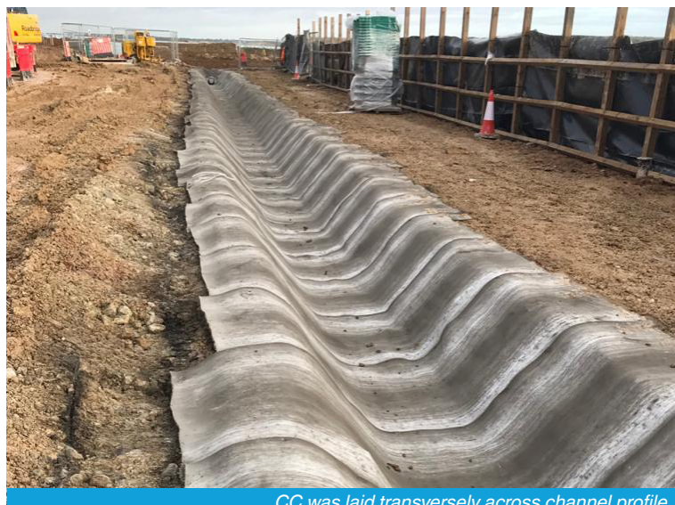
CC was laid transversely across channel profile