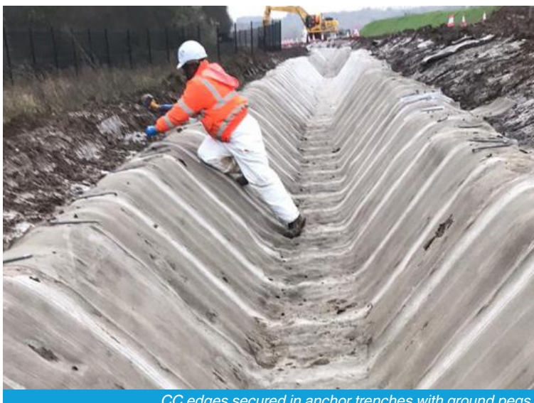
CC edges secured in anchor trenches with ground pegs