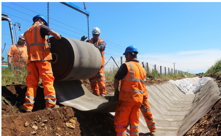
CC has been used on several Network Rail projects