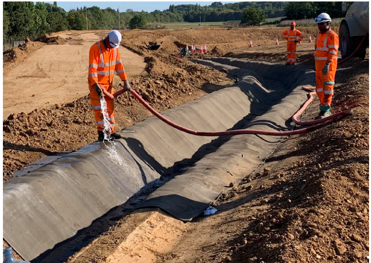
Hydration was given via bowser and hose