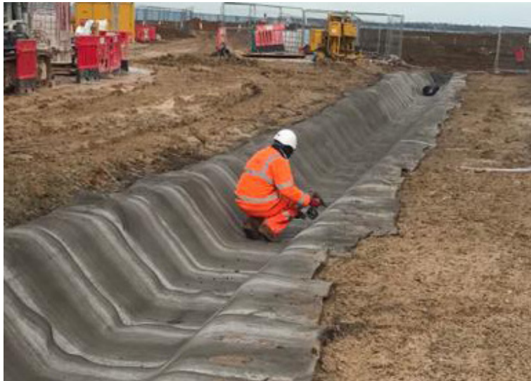
Overlapping layers of CC jointed using SS screws