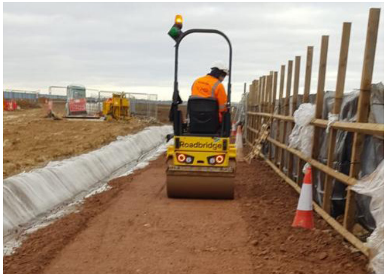
Ground on channel shoulders later compacted

A total of over 8900m 2 of CC8™ were installed by a team of five during this project phase. The client was happy with the outcome of the project. CC will provide effective drainage measures for the site while the compound is in use.