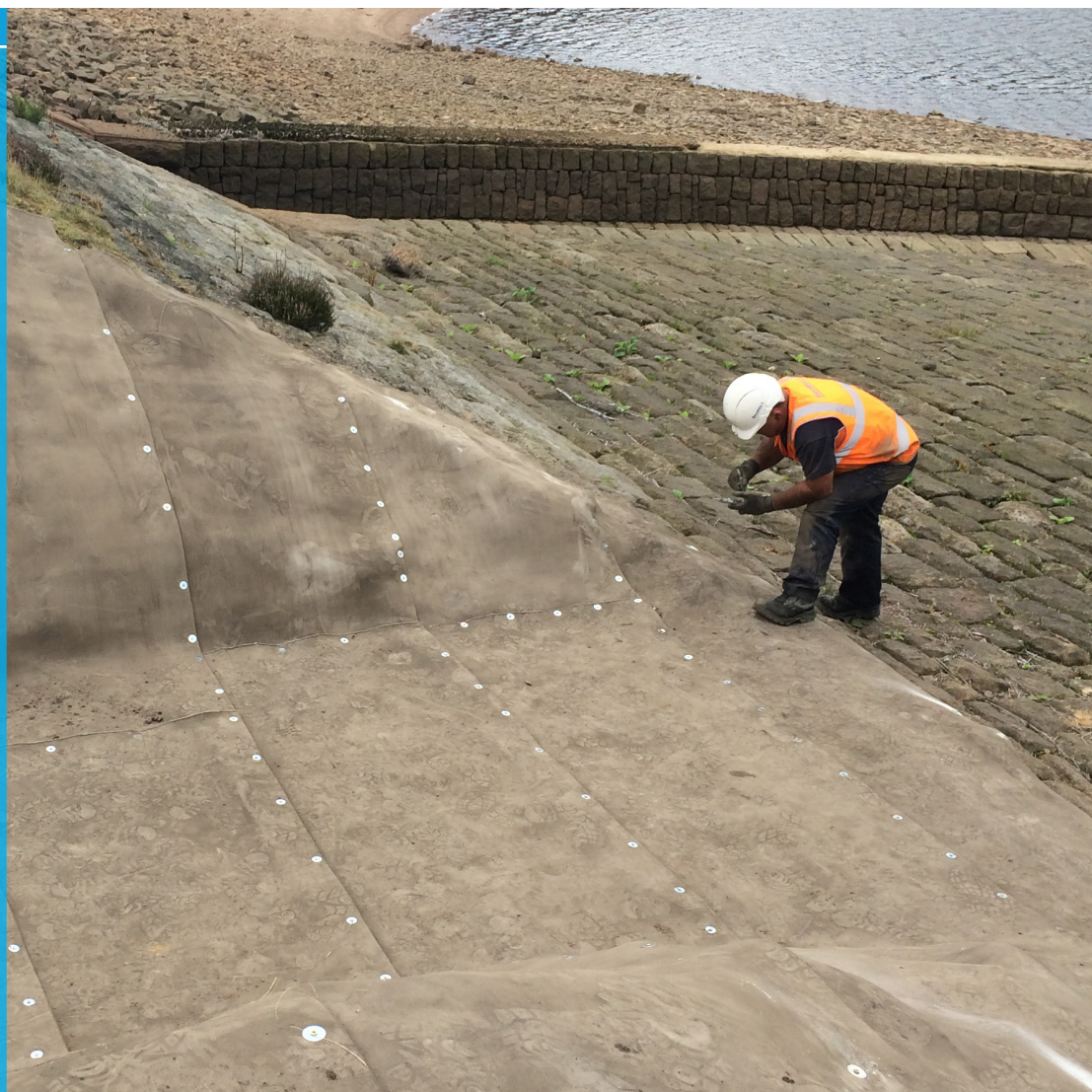
Drainage channel prior to hydration.

In August 2014, Concrete Canvas® GCCM* (CC) was used to line a drainage channel at Widdop Reservoir, Yorkshire, UK. CC provided cost savings compared to conventional concrete solutions given the speed of installation in a remote, limited access location. The works were carried out by Contractors J N Bentley on behalf of the consultant Mott MacDonald Bentley for Yorkshire Water.