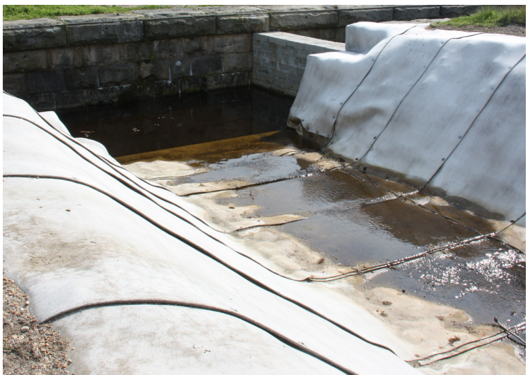
The drainage channel after hydration.