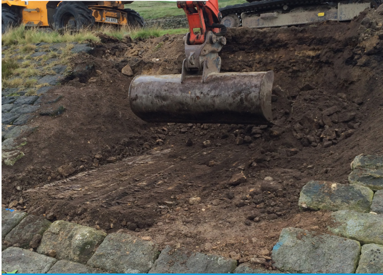
Site being cleared.