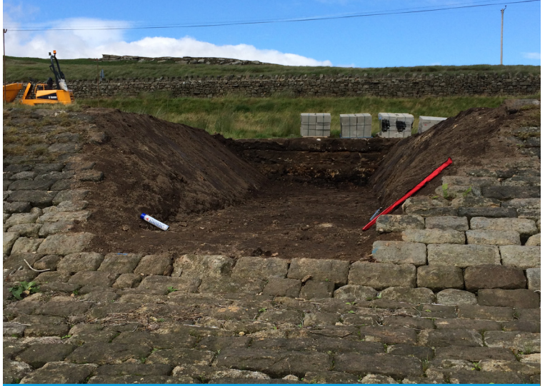
The drainage channel after being excavated.