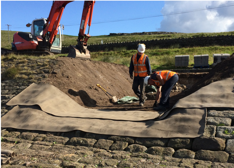
The CC starting to be fitted.