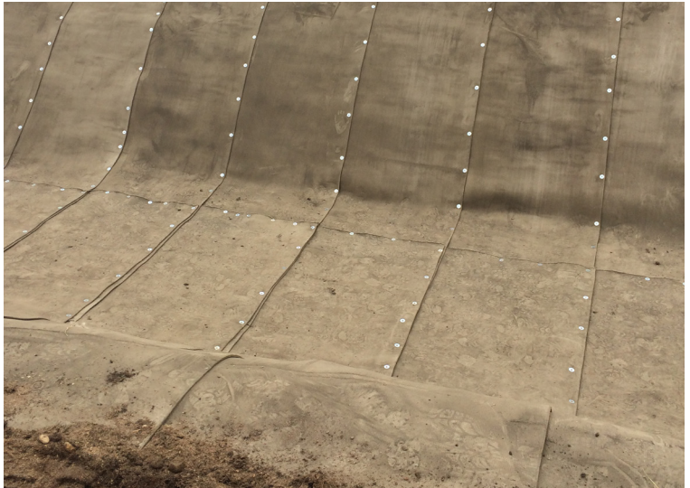
Small penny washers were also used.