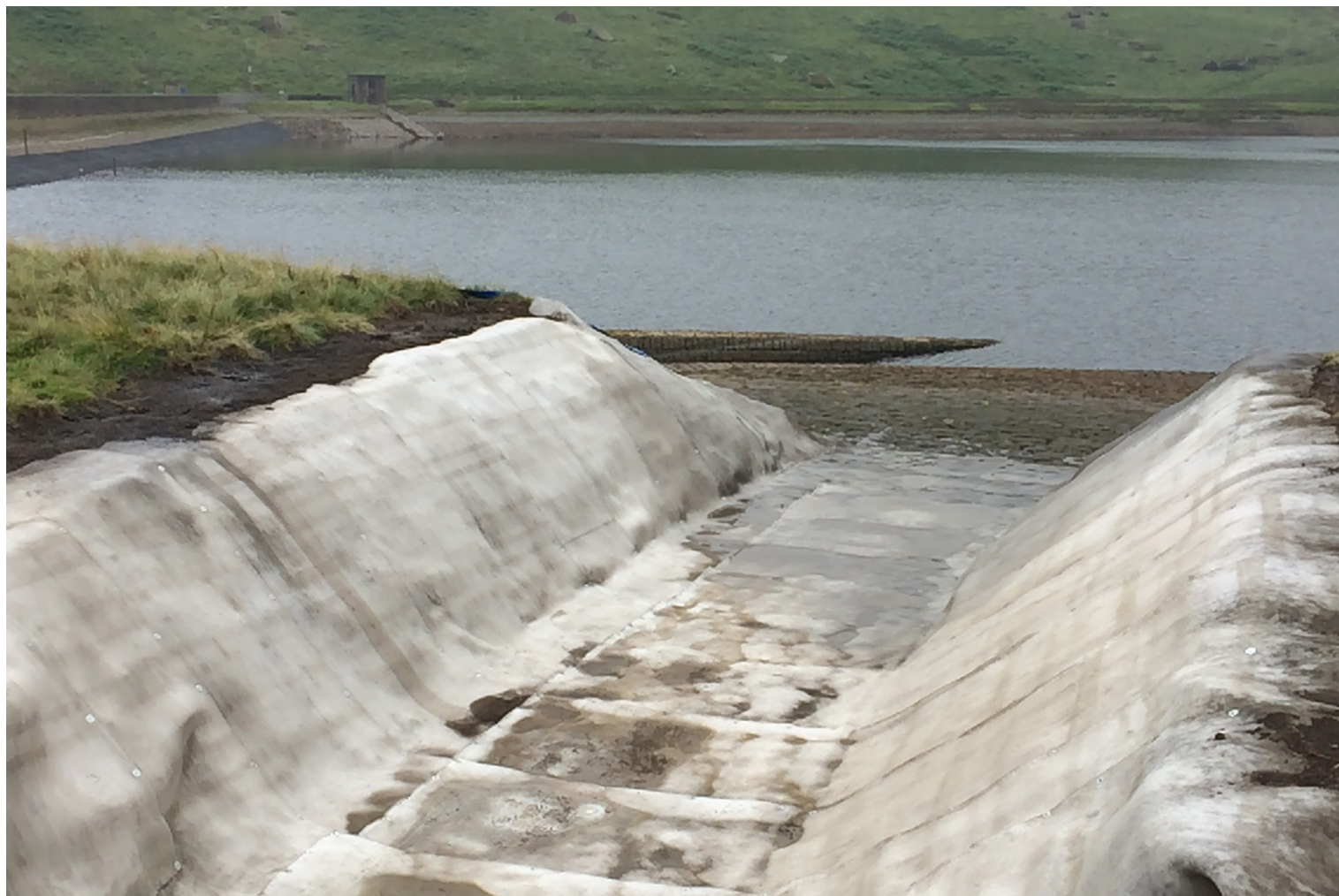
Completed drainage channel installation.

Nails were shot-fired into the blockwork of the existing reservoir wall. In the newly dug channel the joints were screwed together, with small penny washers also being used. No anchor pegs were used, however the CC was back filled into an anchor trench. A sump pump was used from the drainage channel above the temporary dam to hydrate the sides and bottom.