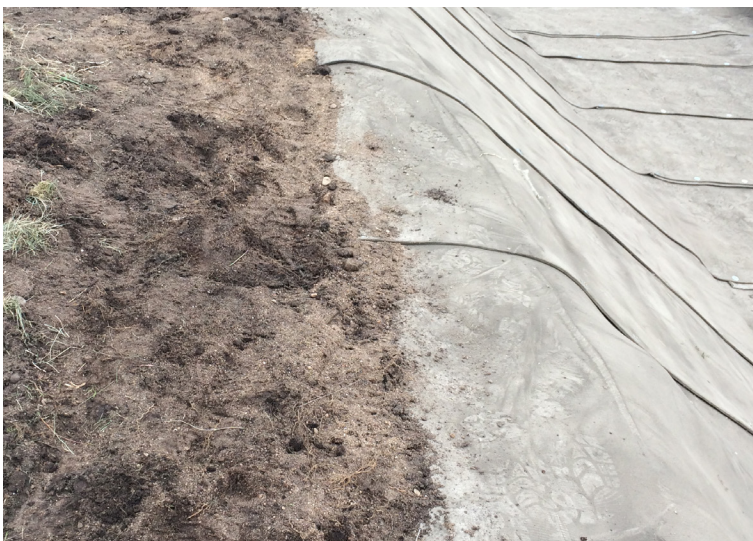
The CC was back filled into an anchor trench.