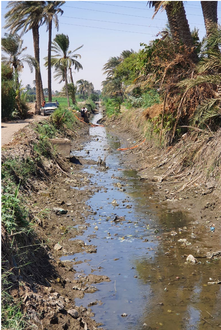
Site prior to works

In terms of climatic conditions, the site location is very hot year-round with average daily temperatures of between 35 and 40 degrees Celsius at the time of the trial. During September it is also common to have significant drying conditions due to wind which prevailed during the course of the trial.