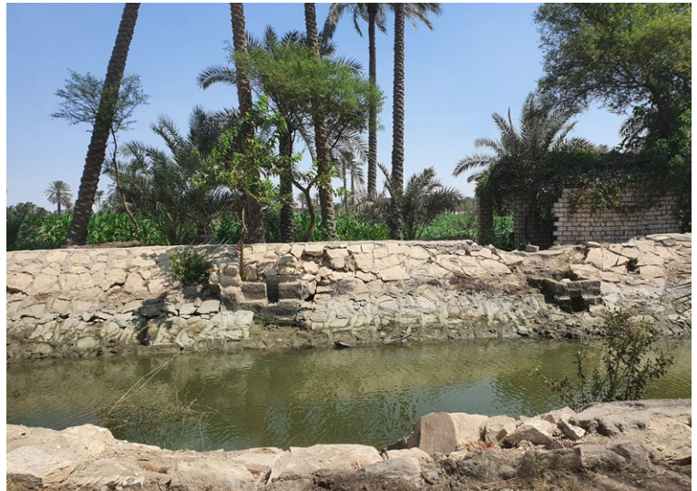
The existing solutions used showing degradation