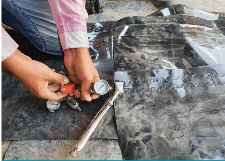
Test welds were carried out and pressure tested prior to installation