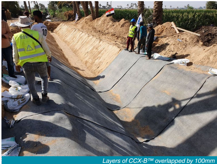
Layers of CCX-B™ overlapped by 100mm

The installation progressed at a rate of approximately 75sqm per hour and was completed within half a day.