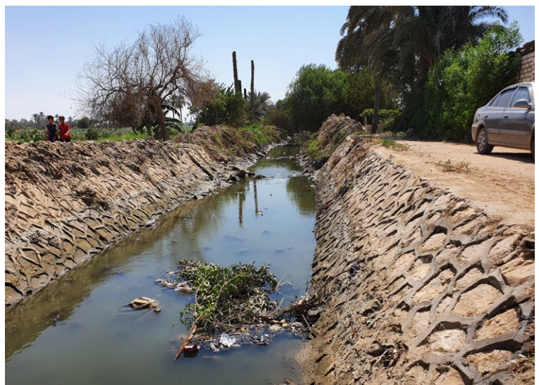
The existing solutions used showing degradation