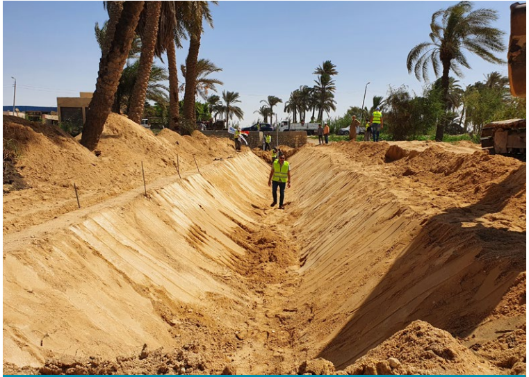
Canal profile following compaction of substrate