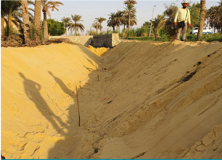
Following excavation, a sand-based gravel substrate was imported