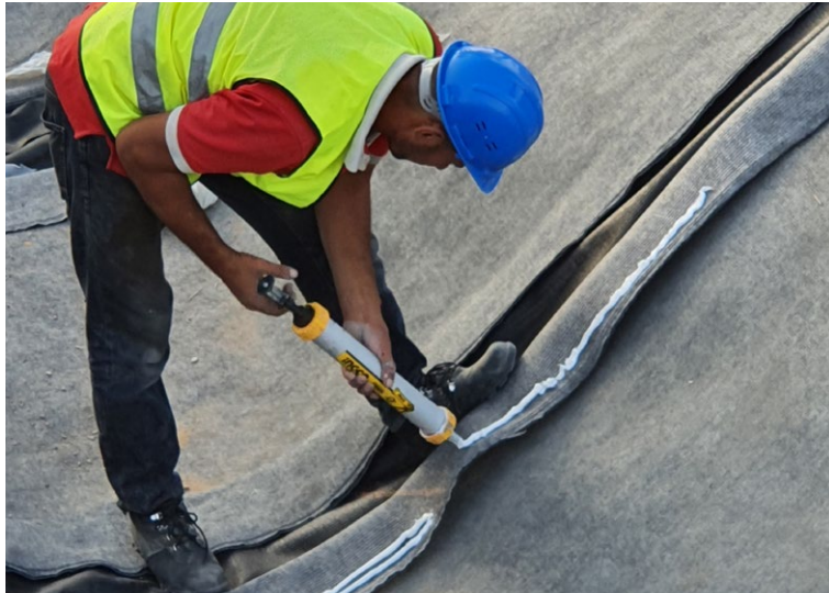
Adhesive sealant applied to overlaps