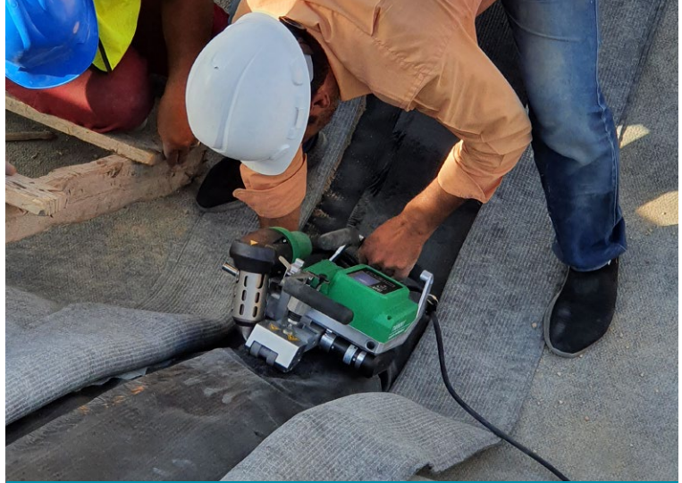
Thermally welding geomembrane backing layers