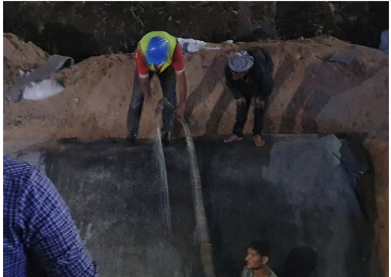
Hydration of CCX-B™ at dusk to avoid excessive evaporation