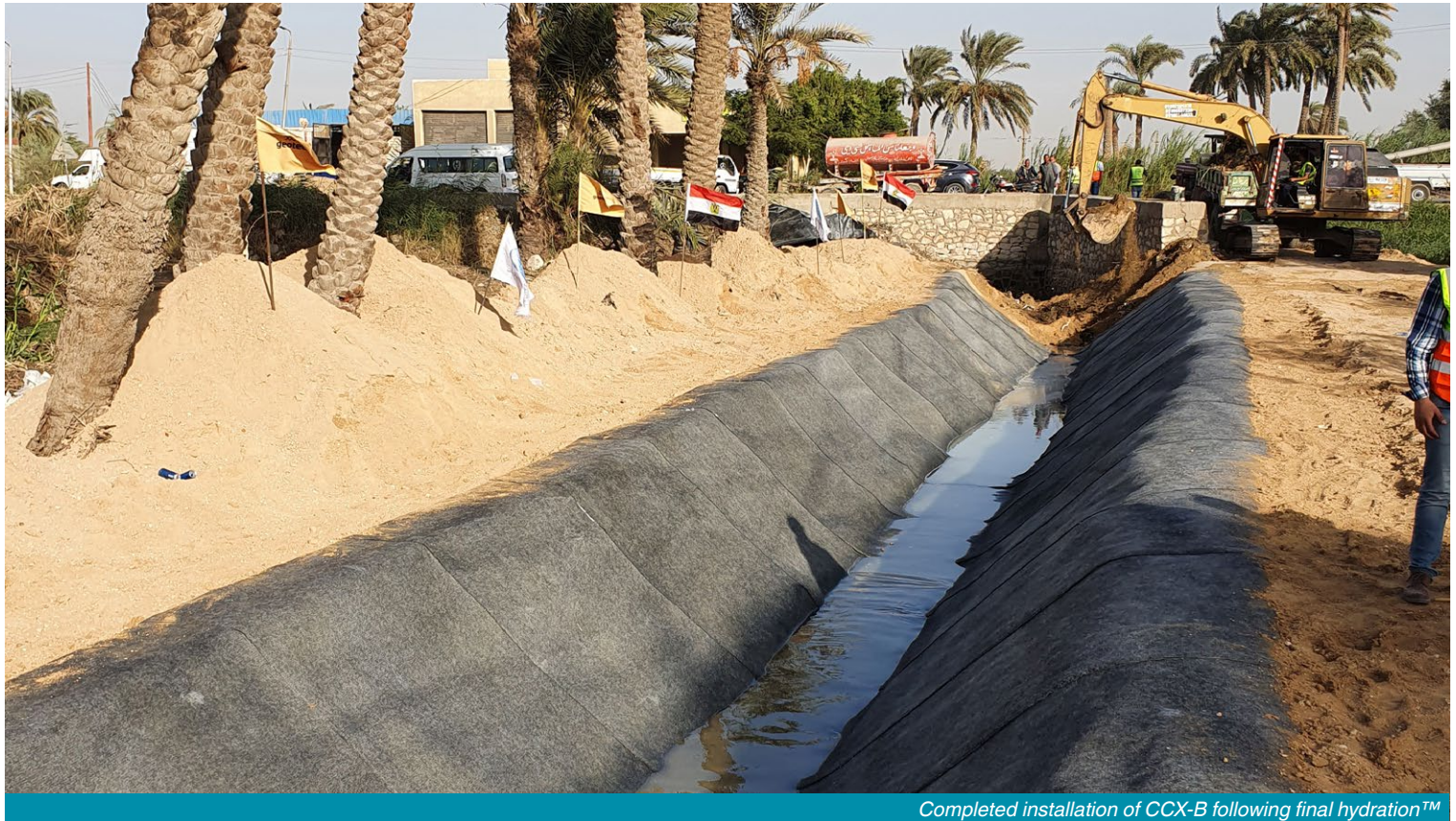
Completed installation of CCX-B following final hydration TM

The 50m length of canal lined with CCX-B TM is noticeably more efficient than the unlined section positioned upstream and downstream. CCX-B TM provides a more durable, erosion resistant and impermeable solution than that currently incorporated on the canal network and is fit for purpose for all future canal linings of similar terrestrial conditions.