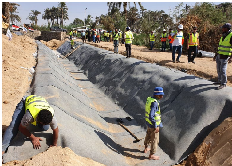
Tucking downstream edge into anchor trench