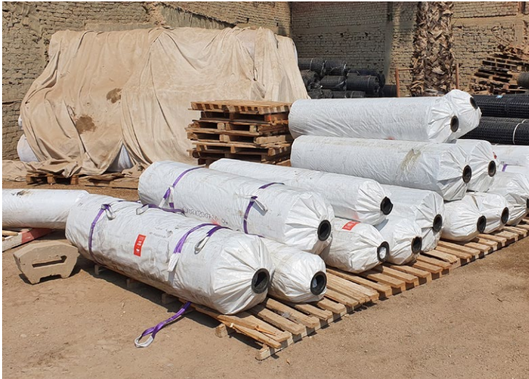
Rolls of CCX-B™ were delivered to site by truck