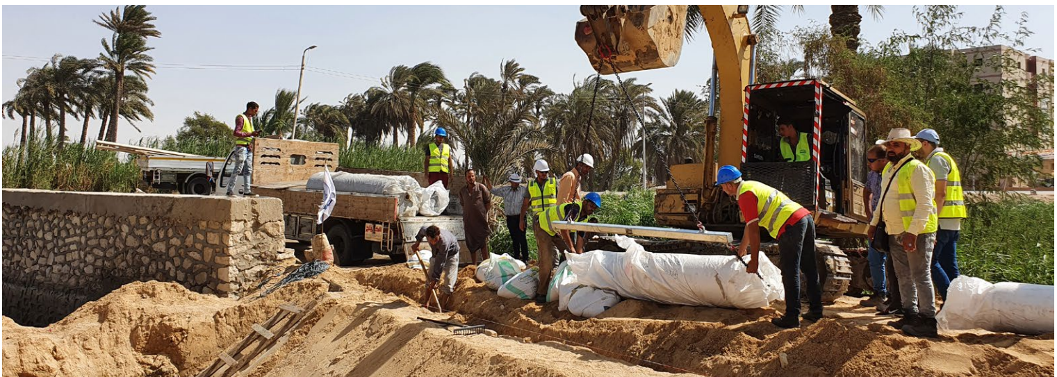
CCX-B™ rolls positioned along the canal shoulders for easier deployment