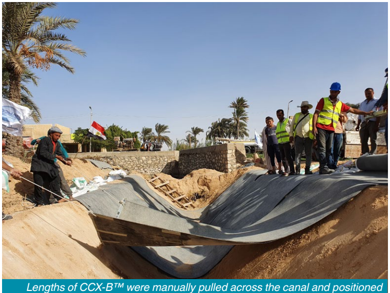
Lengths of CCX-B™ were manually pulled across the canal and positioned