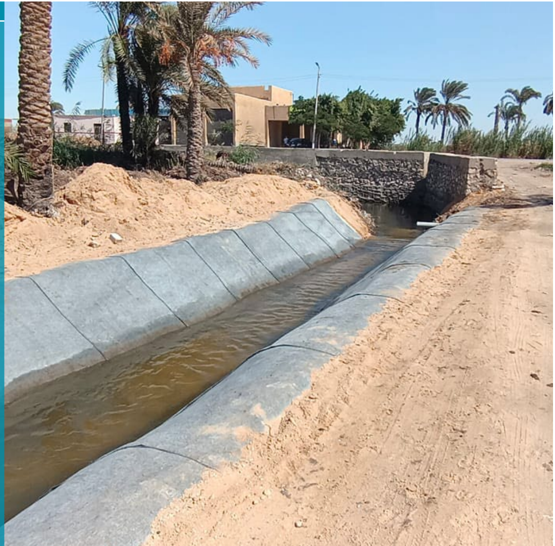
Completed CCX-B TM trial installation in Egypt

CCX-B TM installed on a trial basis to provide a non-erodible and impermeable liner to an unlined irrigation canal