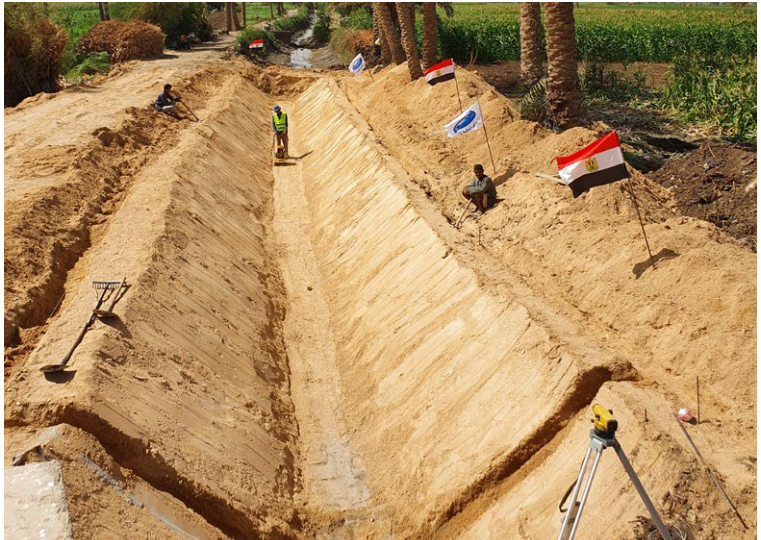
Anchor trenches created on canal shoulders and 50m termination point