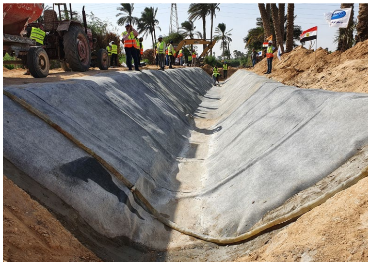
Downstream anchor trench backfilled with poured concrete