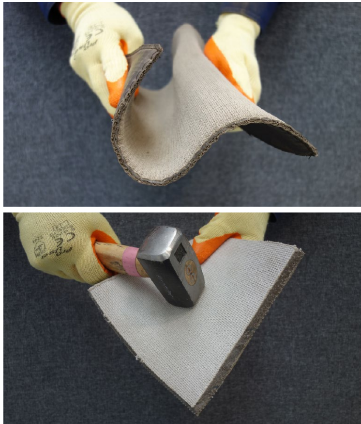
Figure 1. The change of GCCM properties from flexible to rigid on curing means that when assessing GCCM properties, appropriate test methods should be used to determine the cured, in-service GCCM cementitious layer performance.