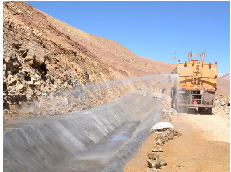
Figure 2. GCCM hydrated by spraying resulting in pooling water in the invert. These parts of the GCCM structure cure in immersed conditions.

GCCMs are hydrated in the field by spraying or immersion and whilst the hydration water is often applied by spraying, immersion almost always occurs in the field due to pooling of water on the surface of the GCCM. When testing for GCCM compressive strength it is essential that the water/cement ratio used in the cube testing is representative of the ratio achieved during hydration of the GCCM on site, in the worst-case situation.