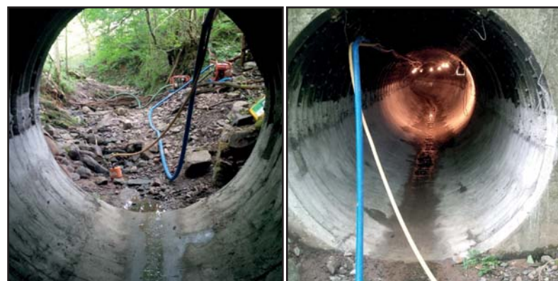
Example of filled culvert crenulations prior to CC installation.

TO BE USED FOR ILLUSTRATIVE PURPOSES ONLY.