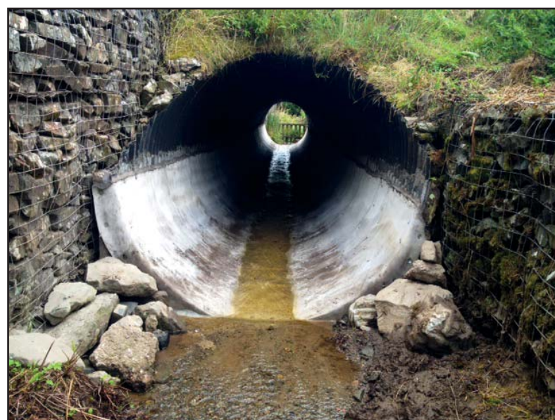
CC lined culvert.